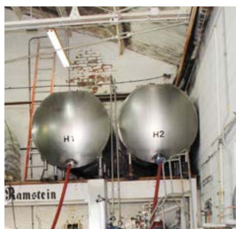
Horizontal Brite Tanks