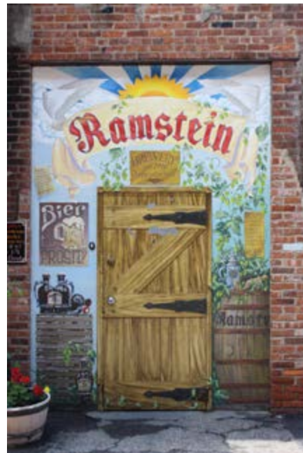
Brewery -Left, Brewery Sign Top Right, Entrance Door Bottom Right