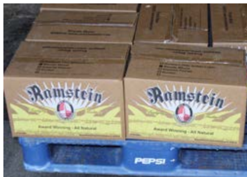
Cases of the Blonde Awaiting Distribution