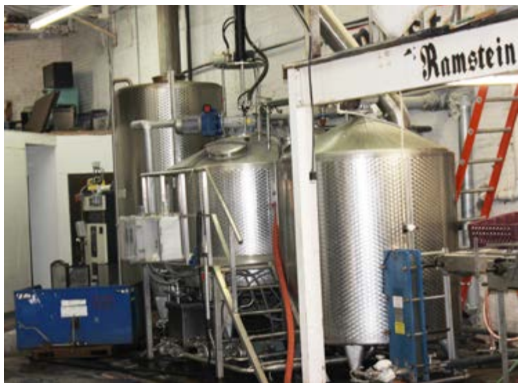
Hot Liquor Tank and 15 BBL Brewhouse

Incorporated in 1994, High Point has been rolling out the barrels since the latter part of 1996. The name is a nod to the highest NJ town it almost opened in and a nod to Bavaria's highest point of Mount Zugspitze, also the highest peak in Germany. The Brewery encompasses 6000 square feet of brew space and 1000 square feet of office space in an adjacent building. It has a 15 BBL Brewhouse that can effectively pump out 19 BBLs with 3 15 BBL and 6 30 BBL Fermenters, 2 30 BBL Horizontal Brite Tanks,