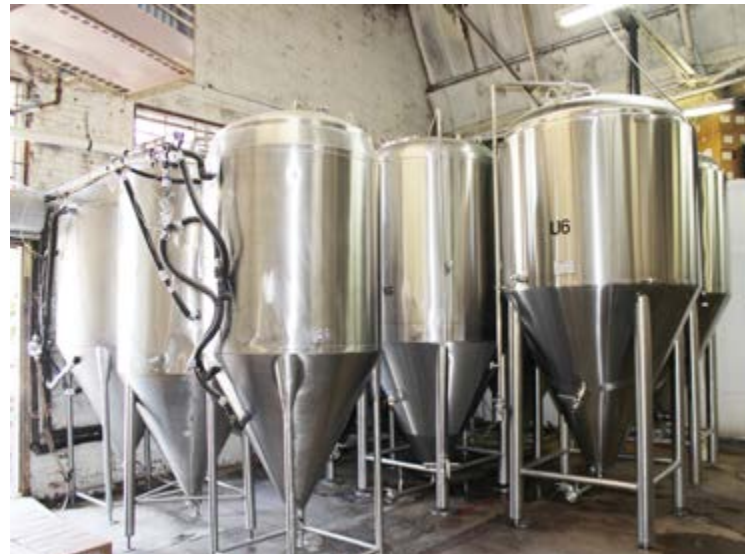
15 and 30 BBL Fermenters

an automated bottling line and an automated keg filler. By the end of July he will add an additional 45 BBL Fermenter and a 45 BBL Horizontal Brite Tank that should bring production to 5000 BBLs by the end of 2015. There is also talk of a Taproom expansion as well. This place boasts many visits by the late and great Michael Jackson who realized years ago how great the beer was as he pointed out in some of his books. Throughout the year, they roll out the kegs in the form of sixtels and halves along with 12